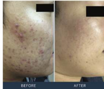
MALE AGE 26 | 3 PROCEDURES