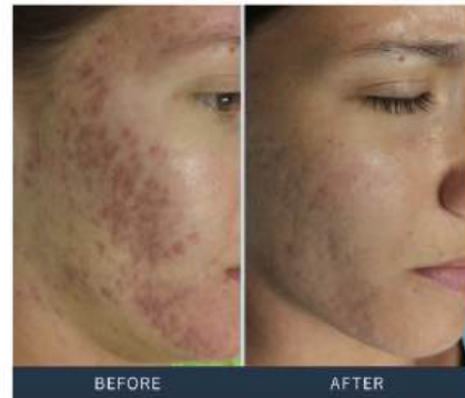
FEMALE AGE 26 | 6 PROCEDURES